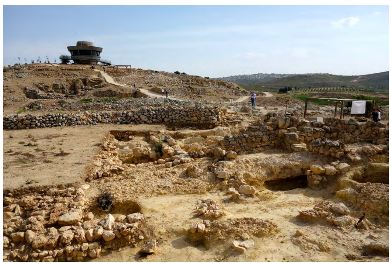
Figure 6. Ruins of ancient Shiloh on Tel Shiloh (Khirbet Seilun), West Bank.77 The site is near modern Seilun, 18 kilometers south of Nablus. The site was reoccupied from about 1200 BCE until about 1050 BCE when the area was burned, correlating to events in 1 Samuel 4. The city was later rebuilt, then abandoned again after the Assyrian conquest in 722 BCE. Off and on occupation continued for many centuries afterward. Opened in 2014, the "HaRo'eh Tower" ("Tower of the Seer" from Hebrew רְאָה, ro'eh = seer, referring to Samuel<sup>78</sup>) now sits atop the tel, the first among many large projects that are being undertaken to increase tourism at the site. Israel Finkelstein has proposed that the Tabernacle was housed on the summit of the tel.