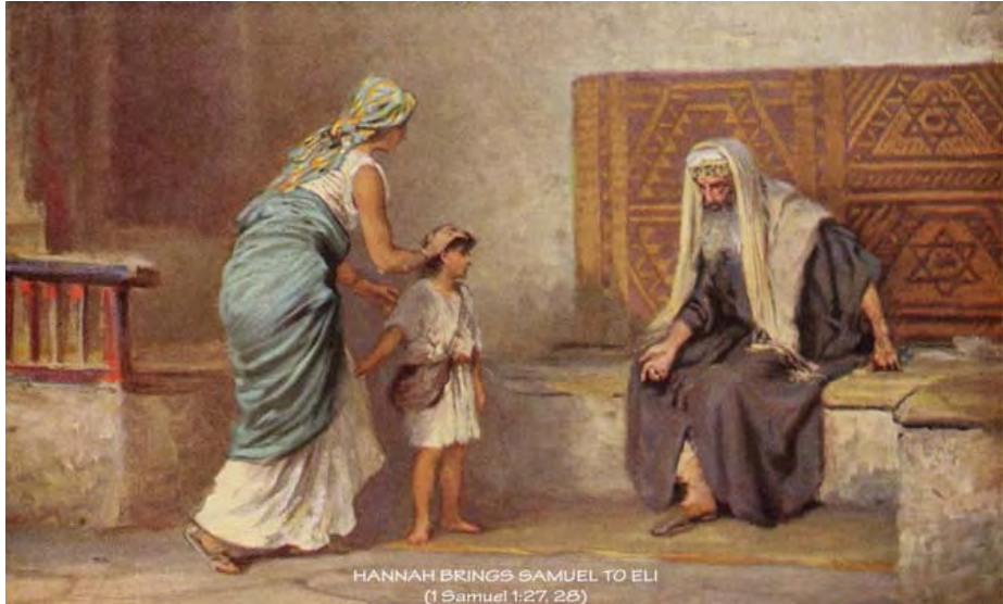
Figure 2. The Dedication of Samuel

With the these examples in mind, we will examine the story of Samuel's call verse-byverse — and its implications for our own responses to God's invitations to serve.