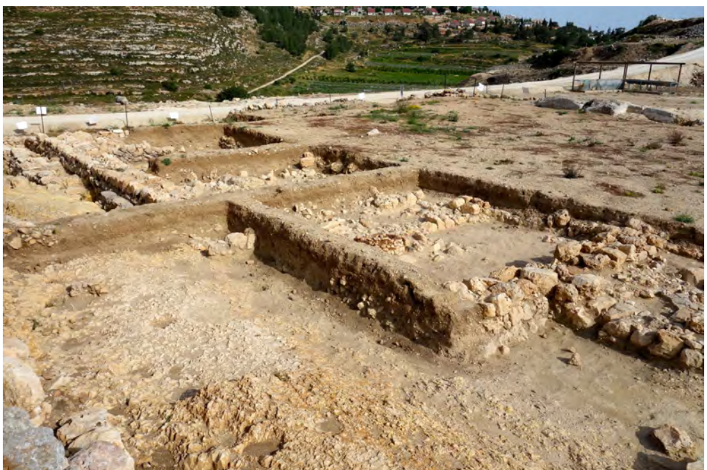
Figure 7. Some traditions see the location of the Tabernacle as being on the slopes north of Tel Shiloh. Cultic usage of the site persisted over many centuries.<sup>79</sup>