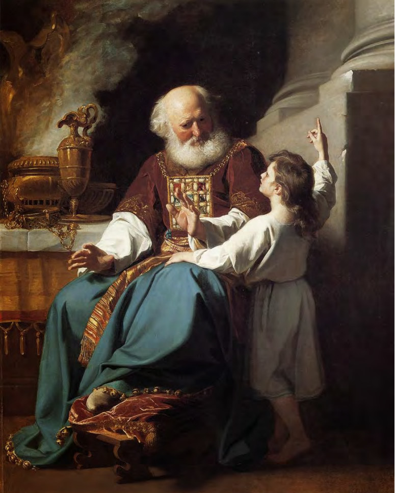
Figure 1. Eli and Samuel

An Old Testament KnoWhy1 relating to the reading assignment for Gospel Doctrine Lesson 21: "God Will Honor Those Who Honor Him" (1 Samuel 2-3; 8) (JBOTL21A)