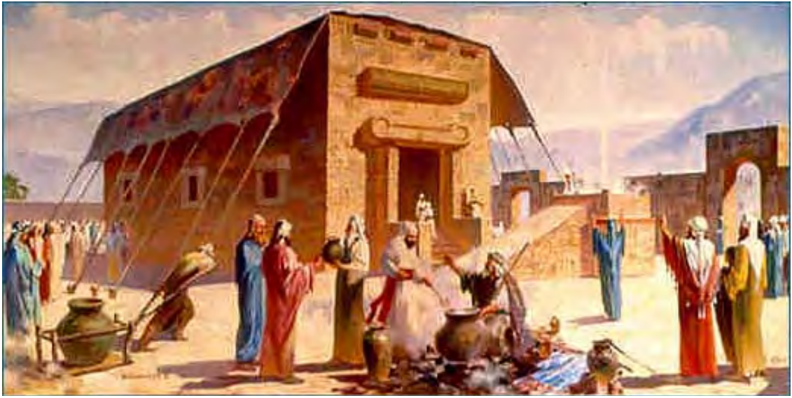
Figure 3. The structure that housed the Tabernacle at Shiloh