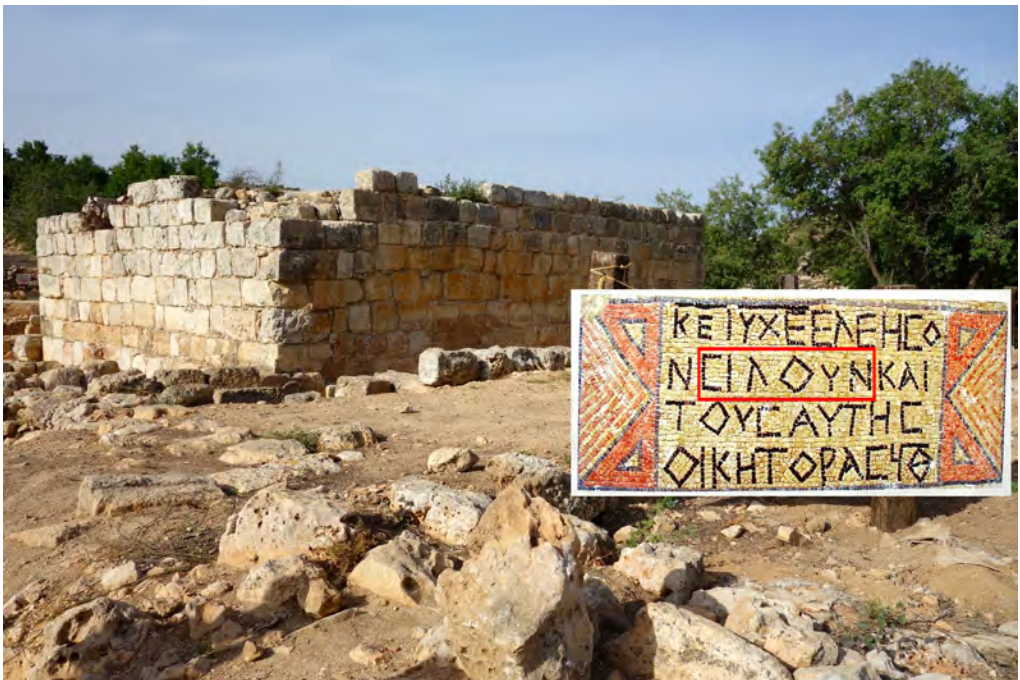
Figure 7. Mosaic floors from a Byzantine church were found underneath the foundation of the Mosque of the Orphan (Jama al-Yatim). Some, especially Christians, tend to identify the location of the Tabernacle with this general area, just south of Tel Shiloh. One of the inscriptions on the Byzantine mosaic floors included a prayer (inset): "... have compassion for the people of Shilo" (CIλOYN = Siloun)<sup>80</sup>